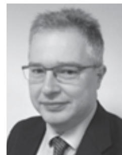
STEVEN SEGAL FORENSIC ACCOUNTING SOLUTIONS