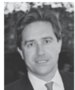
DAVID PLATT QC CROWN OFFICE CHAMBERS